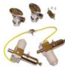
Steps 4- 5 utility center not included